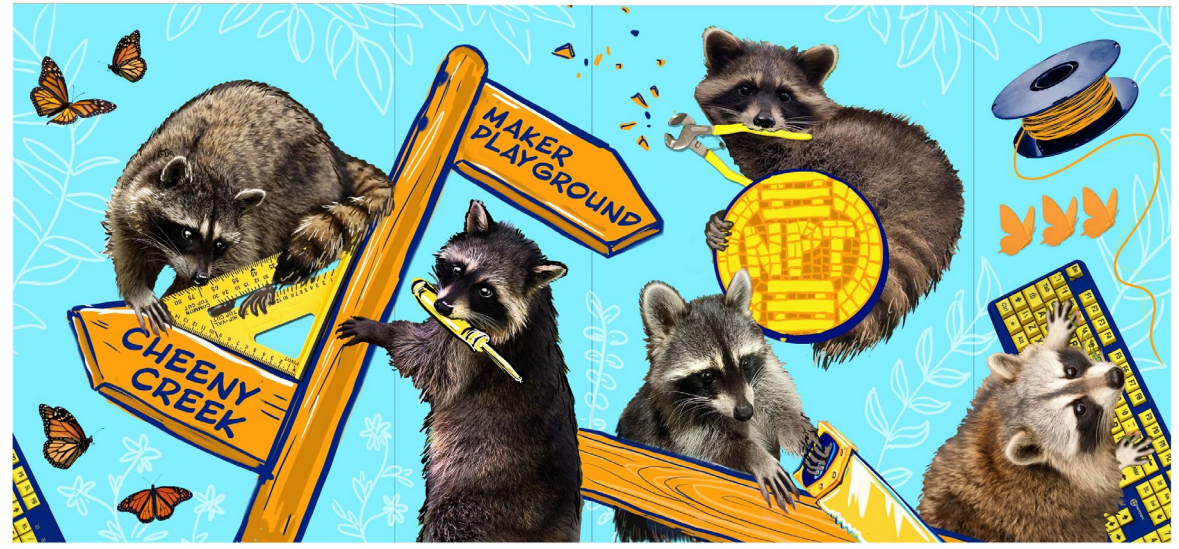
Concept by Abigail Staffelbach Murais LLC

MAIN BOX: Blue background with raccoons fabricating creative projects in mediums including woodworking, tile/mosaic, and 3D printing. A pair of racoons put their skills to the test, installing a hand-made sign for the community.