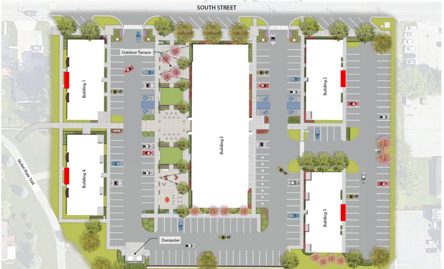
Site Plan: The murals would be located on Building 1, Building 4, Building 2 and Building 5, in areas shown in red.