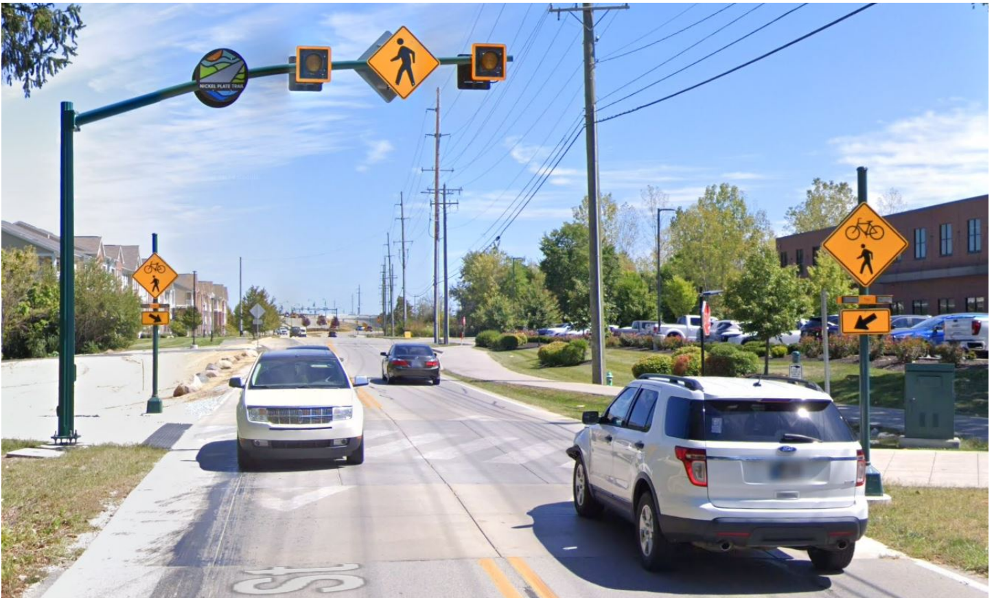
Nickel Plate Trail & E 106th Street

Staff would conduct an RFQ for up to seven artists to paint or wrap each box. The artist would review by the Arts & Culture review committee which will include staff, any Commissioners, with invites will be extended to Fishers Arts Council, Fishers Art Center, Noblesville Creates and Hamilton East Public Library.